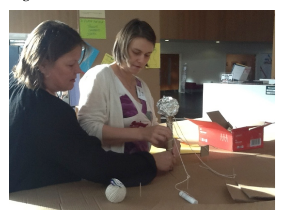
Figure 2: Collaboration: Two delegates working at their model

people to share their experiences, to help make connections, and to encourage meaning making. What happened in the many hours between these "formally" facilitated discussions was up to the delegates, although we aimed for at least one of us to be present at the CoT as much as possible so that we could discuss the process and offer some general guidance if required. So it was to my delight when I arrived early the next morning to see the beginnings of a building and two delegates quietly working away together at their model.