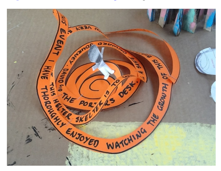
Figure 4: An "outliers" reflection in poetic and metaphorical form

Her comments about the approach being a metaphorical rebuilding of the AoMO community resonate as it had been four years since the last conference and during that time the AoMO "community" had faced a number of challenges. This re-building or re-thinking of a learning community was not lost on one delegate who commented: