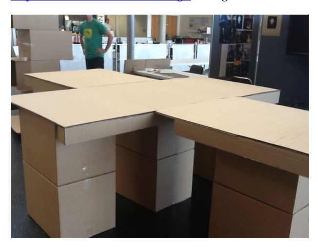
Figure 1: The "crucifix" platform: laying the foundations

At the beginning of the conference we were asked to explain the CoT to the delegates. We lead them to our sturdy cardboard crucifix table that we had built as a learning platform from which the city would be built. It was strategically positioned in the middle of the university space where the conference was being held. In the initial "induction" we outlined our project and some of the objectives. We informed them of the creative constraints we had devised such as the materials available and the size of land people were able to "claim". I wondered how people would perceive it and how they would interact with it and their fellow delegates. Would it provide all the outcomes and possibilities we assumed it could?