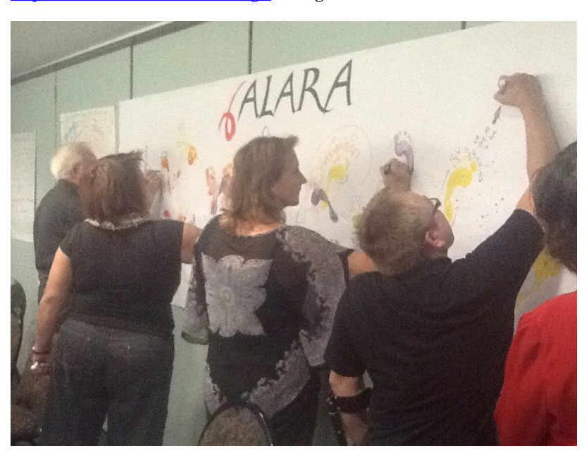
Figure 6: ALARA Conference: delegates make their contribution

With this as a background story, Deb and I developed a series of processes to allow and encourage participants to interact and share their conference experience in other ways. These activities were a mixture of movement, dialogue, no dialogue, gestures, and other embodied relationship-building actions. I created a "graphics" wall, a visual place that people could visit and write their reflection, make their marks and offer their reflections about their conference experience. All of these processes were designed and facilitated to allow delegates to "warm up" to each other, build trust and rapport, help dissolve some of our initial defence mechanisms, and in turn develop an open learning community. I know from experience that not everyone is comfortable with this type of approach. People are always free to participate or not and it is their choice. My concern is that if we play it safe and leave out the experiential, creative and embodied learning processes, then we are potentially missing out on the possibility of new learning and insights due to the inclusion of these creative and artistic methods. "These forms of representation give us access to expressive possibilities that would not be possible without their presence" (Eisner, 2008, p. 5). Overall, the responses we had from