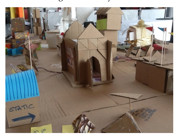
Figure 3: A church emerges from the City of Thought

The COT is still rising and we heard the intentions and visions of our co-builders. Some created buildings alone, representing a built version of their own work activity or take on life. A church rises in the centre, roofless and someone wants to place a madonna in it – some negotiation may be needed. Towers rise up and even an underground, trap-doored realm where "here be dragons". The city is both a collective and a thing of separateness, but the building is not done yet.